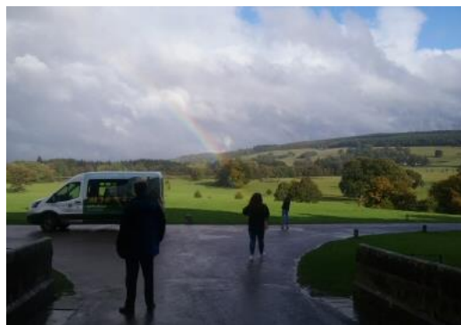
1 Looking out from Chirk Castle on our Chester Weekend, 2019

There was no formal outcome or actions from this last part of the AGM, but the committee is to take things forward and would also seek to co-opt members to help with events, a newsletter etc.