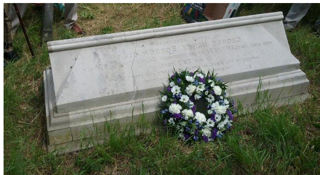
4 Borrow's Grave July 2019 as members laid the wreath

And thus have I stated my disagreements with the Great Shorsa, as Murtagh, the Irish boy, called him. And Murtagh’s pack of cards, by the way, deserve to rank with the adventures of Tom Thumb, Gulliver, Baron Munchausen, Red Riding Hood, and the Swiss Family Robinson—a most marvellous pack of cards, containing enough nap hands, crib hands, and games of all fours, running through two books, “Lavengro” and “Romany Rye.”